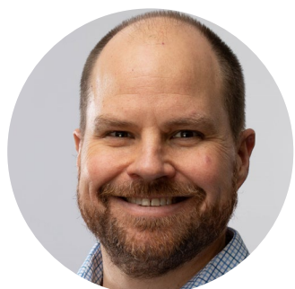
KENT MCINTOSH PHD

Jan is currently the Minister of Internal Affairs, Minister for Women, and Associate Minister of Education.