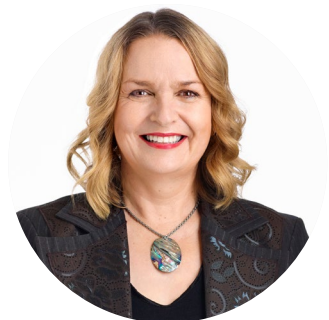
HON JAN TINETTI

Jan is a list Member of Parliament based in Tauranga. She was born in Hokitika and grew up rurally on the outskirts of Christchurch. Jan attended Villa Maria College before graduating from Christchurch College of Education with a Diploma in Teaching (Primary) and the University of Canterbury with a Bachelor of Education. In 2016 she graduated from the University of Canterbury with a Masters in Education with First Class Honours.